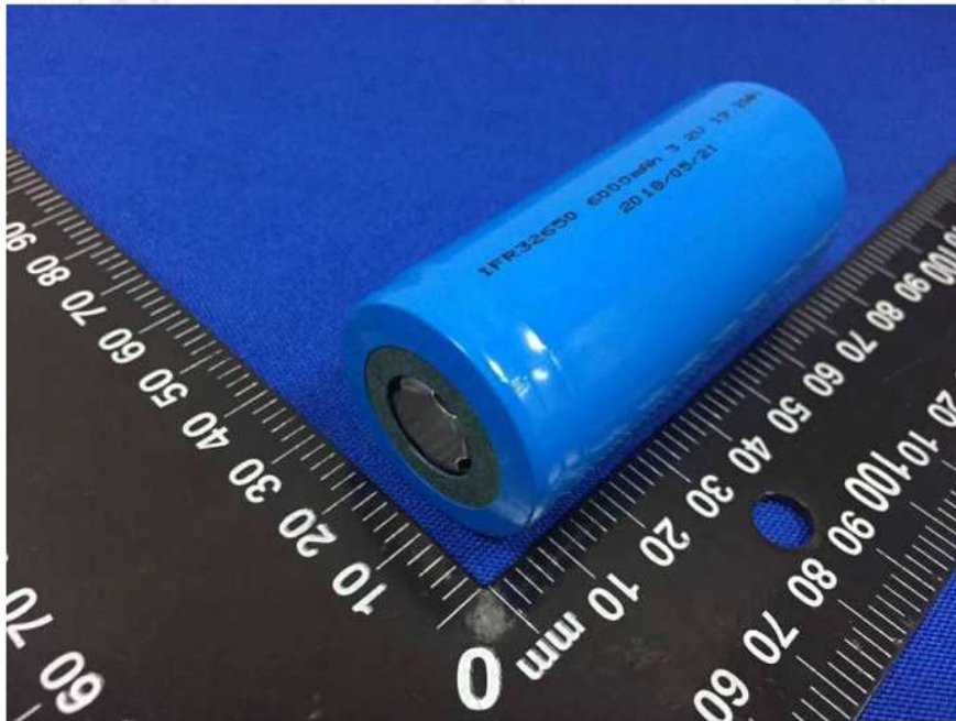
Picture 1. Cell view